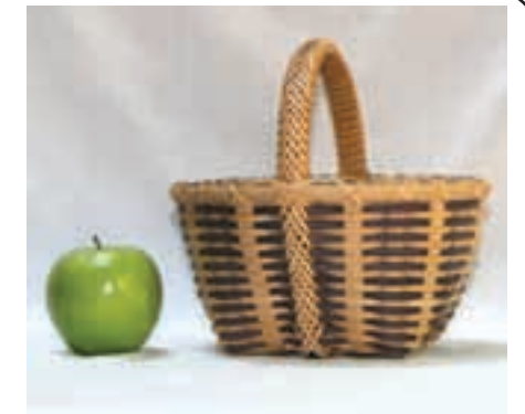
FR-6-138 Friday 9:00am-4:00pm

6 Hours 6"Hx9" dia Intermediate / Advanced $40