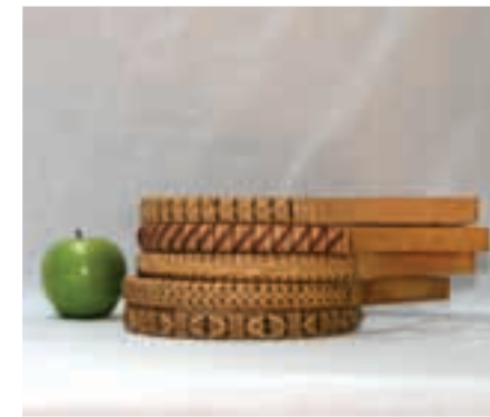
TH-MB-144 Thursday 1:00pm-3:00pm

2 Hours 3”Wx5” Lx6”H All Levels $59 /2 baskets