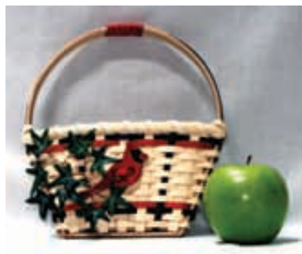
TH-MB-58 Thursday 1:00pm-3:00pm