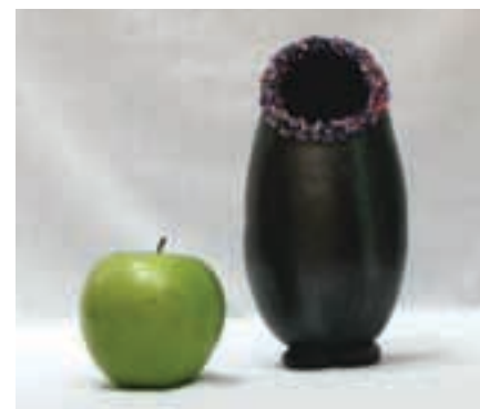
SU-4-68 Sunday 8:00am-12:00pm

4 Hours 1 1/2"Wx1 1/2"H Intermediate $20