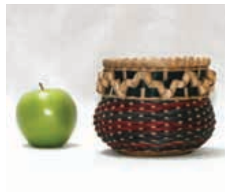
SU-4-218 Sunday 8:00am-12:00pm

4 Hours 2" dia Beginner / Intermediate $40