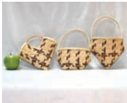
FR-8-135 Friday 8:00am-5:00pm