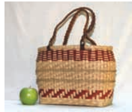
SA-8-189 Saturday 8:00am-5:00pm

8 Hours Basket #1- 6”H x 13” dia (Lazy Susan) Basket #2 - 4½”H x 5 ½” dia Intermediate/Advanced $75