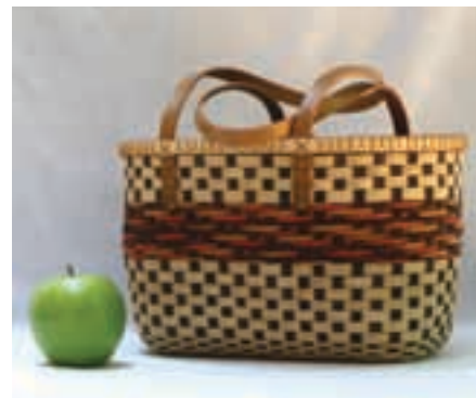
FR-4-329 Friday 8:00am-12:00pm

4 Hours 2" W x 2 1/2" L x 2 1/2" H All Levels $48