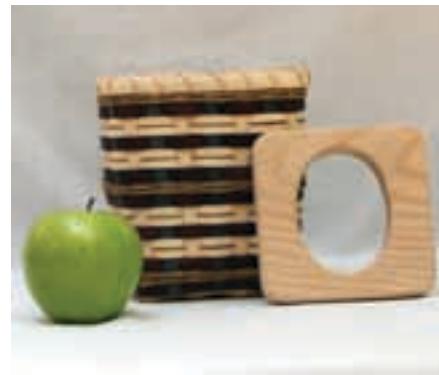
TH-4-276 Thursday 4:00pm-9:00pm

4 Hours 1/2"Wx1 1/2"Lx1 3/4"H Intermediate $20