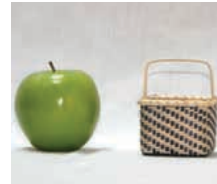
SA-8-249 Saturday 8:00am-5:00pm