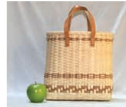
FR-8-246 Friday 8:00am-5:00pm

8 Hours 9" W x 17" L x 8" H Intermediate $62