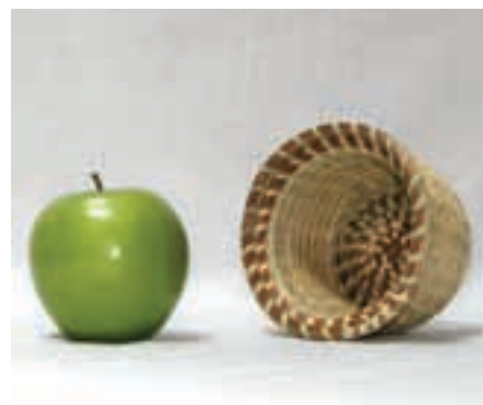
SU-4-264 Sunday 8:00am-12:00pm

4 Hours 1/4" Wx3" Lx3 1/2" H Intermediate $24