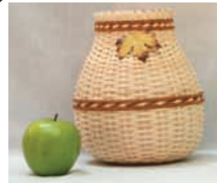
TH-6-323 Thursday 1:00pm-8:00pm

4 Hours 4½"H x 6¾" dia Beginner/Intermediate $55