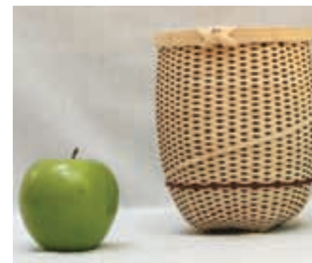
FR-6-216 Friday 9:00am-4:00pm

6 Hours 5-9" SQx5" Lx5½"H 10"w/handle Intermediate $59