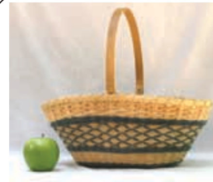
FR-6-48 Friday 9:00am-4:00pm