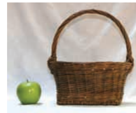
SA-8-308 Saturday 8:00am-5:00pm

8 hours 10"W x 21"L x 8"H Beginner/Intermediate $45