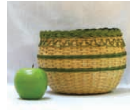
TH-4-49 Thursday 4:00pm-9:00pm

4 Hours 15" H x 11" dia Intermediate $49