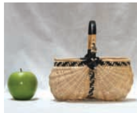
FR-8-167 Friday 8:00am-5:00pm

8 Hours 7"Wx7"Lx8"Hx9" dia Intermediate $60