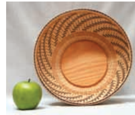
TH-6-86 Thursday 1:00pm-8:00pm