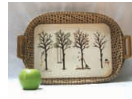
SU-4-326 Sunday 8:00am-12:00pm

Four Seasons Tray Julie Kleinrath Grand Junction, CO