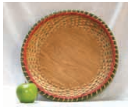
FR-8-197 Friday 8:00am-5:00pm

8 Hours 5½"W x 8½" L x 9½"H with handle Intermediate/Advanced $65