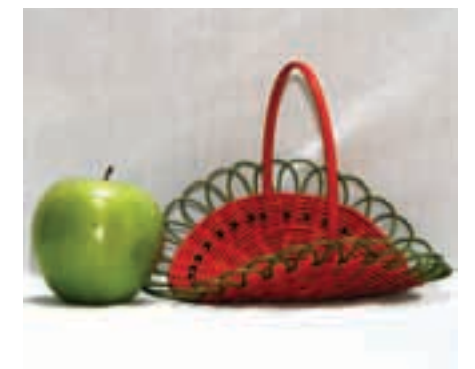
TH-4-133 Thursday 4:00pm-9:00pm

4 Hours 11½" L x 7" H x 11½" dia All Levels $52