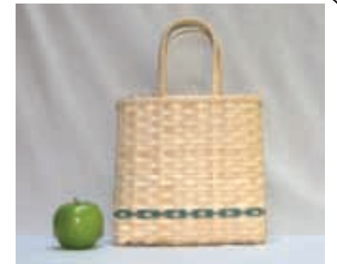
FR-4-21 Friday 8:00am-12:00pm

10 Hours 3"H x 25" dia Intermediate/Advanced $135