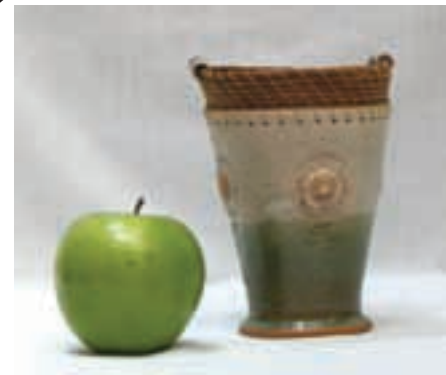
TH-6-184 Thursday 1:00pm-8:00pm