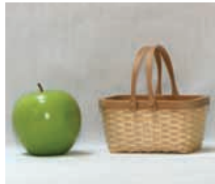
FR-4-195 Friday 1:00pm-5:00pm

4 Hours 2 3/4" H x 3 1/2" dia Intermediate $85