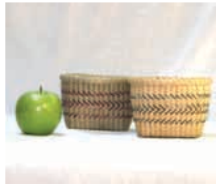
FR-8-148 Friday 8:00am-5:00pm