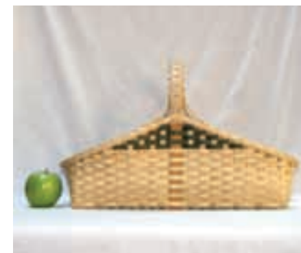
SA-8-301 Saturday 8:00am-5:00pm

8 Hours 8"Hx11" dia Intermediate/Advanced $80