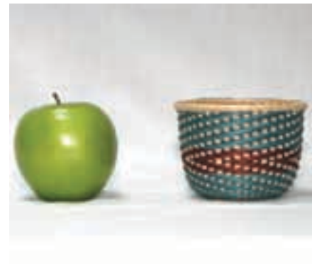
SA-6-255 Saturday 9:00am-4:00pm