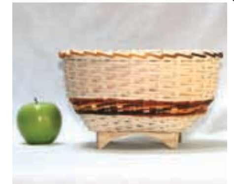
SA-8-265 Saturday 8:00am-5:00pm

8 Hours 2½"Wx2½"Lx4"H Intermediate/Advanced $45