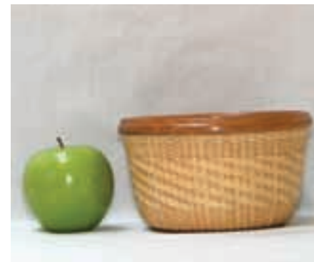
SA-4-29 Saturday 8:00am - 12:00pm