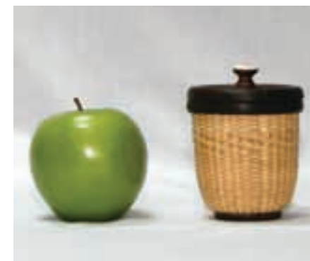
TH-4-71 Thursday 4:00pm-9:00pm

4 Hours 1" W x 2" H Beginner / Intermediate $40