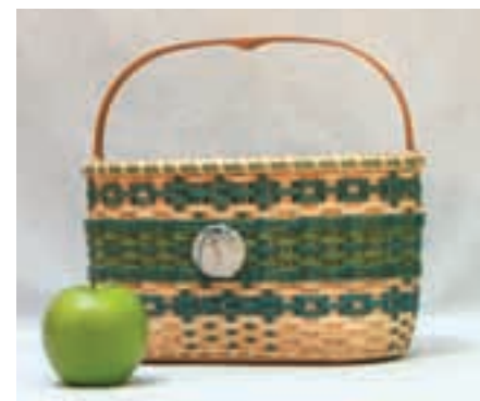
SA-6-59 Saturday 9:00am-4:00pm

6 Hours 5 1/2"Hx11 1/2" dia Beginner / Intermediate $66