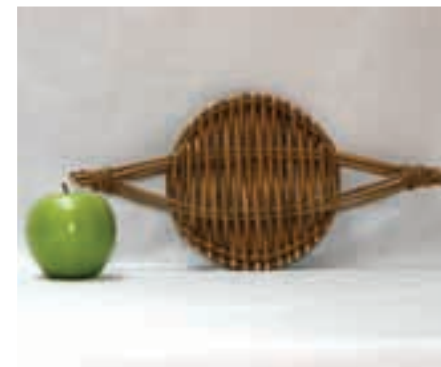
TH-MB-163 Thursday 1:00pm-3:00pm

2 Hours 6” Lx6”Hx4” dia Beginner/Intermediate $25