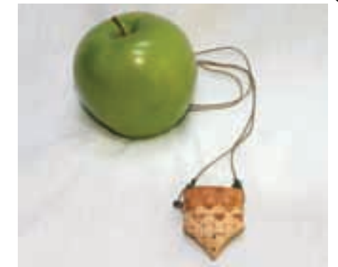
SU-4-63 Sunday 8:00am-12:00pm

4 Hours 3 1/2"Lx4 1/4" dia Intermediate / Advanced $70