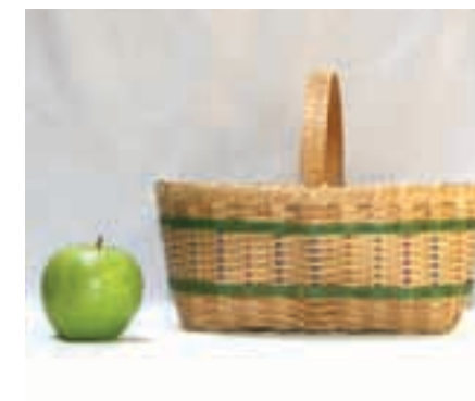
SU-4-90 Sunday 8:00am-12:00pm

4 Hours 8 1/2"Hx 4" dia (gourds Vary) All Levels $50