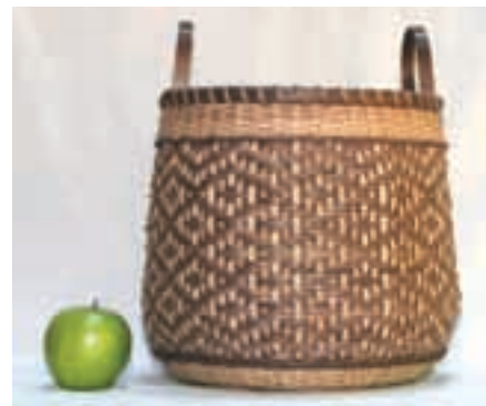
FR-10-13 Friday 9:00am-4:00pm Saturday 8:00am-12:00pm