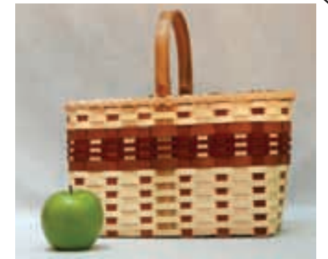
TH-6-91 Thursday 1:00pm-8:00pm