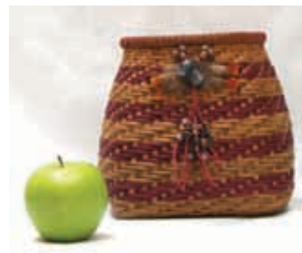
SA-6-330 Saturday 8:00am-3:00pm

6 Hours 9" H x 8" dia Beginner / Intermediate $55