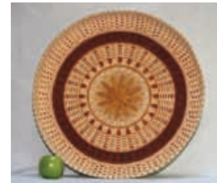
TH-10-93 Thursday 4:00pm-8:00pm Friday 9:00am-4:00pm