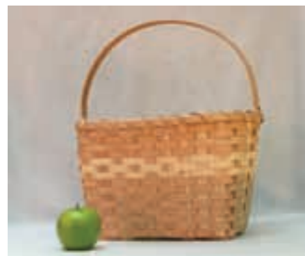
TH-6-33 Thursday 1:00pm-8:00pm

4 Hours 6"Wx8"L Beginner / Intermediate $60