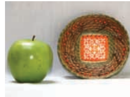
TH-6-66 Thursday 1:00pm-8:00pm