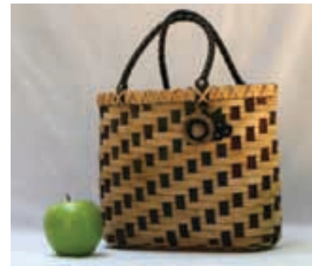
TH-4-324 Thursday 4:00pm-9:00pm

4 Hours 6 1/2"Wx6 1/2"Lx7"H All Levels $40