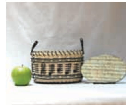
FR-4-117 Friday 1:00pm-5:00pm

4 Hours 1⅞"H x 2½" dia Intermediate/Advanced $40