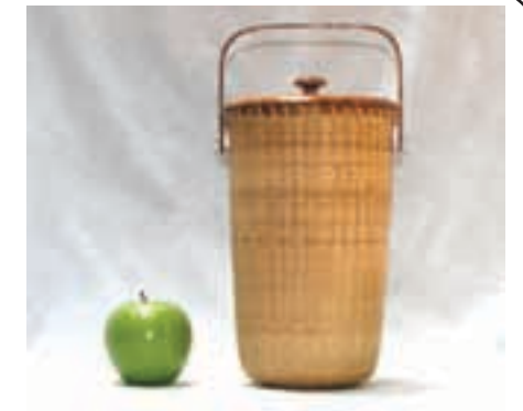
FR-8-107 Friday 8:00am-5:00pm

8 Hours 6"Wx12"Lx15"H (w/handle) Advanced $72