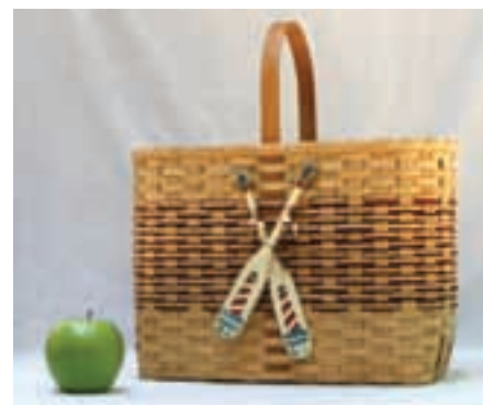
TH-6-318 Thursday 1:00pm-8:00pm