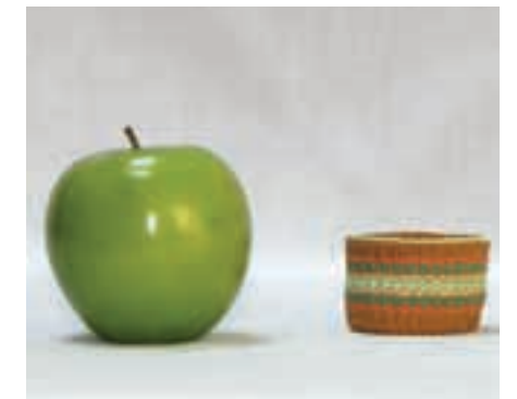
FR-8-126 Friday 8:00am-5:00pm