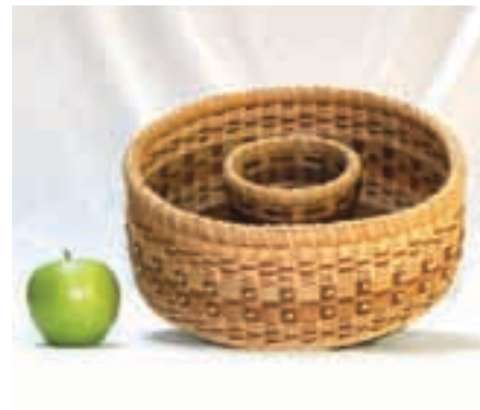
SA-8-172 Saturday 8:00am-5:00pm

8 Hours 18½”Hx10½” dia Intermediate/Advanced $65