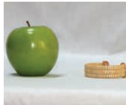
FR-4-340 Friday 8:00am-12:00pm

4 Hours 9 1/2" W x 13" L x 8" H Beginner / Intermediate $50