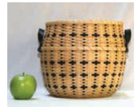
SA-8-315 Saturday 8:00am-5:00pm