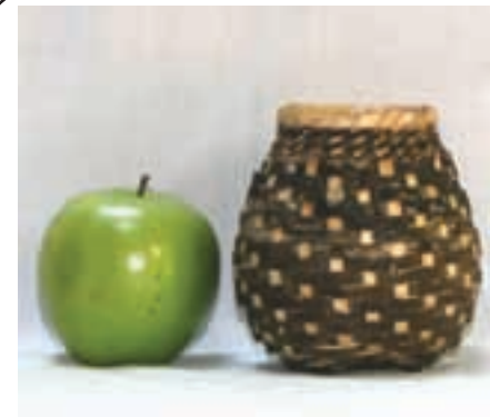
SA-4-337 Saturday 1:00pm-5:00pm

6 Hours 2"Lx4 1/4" dia Beginner / Intermediate $70