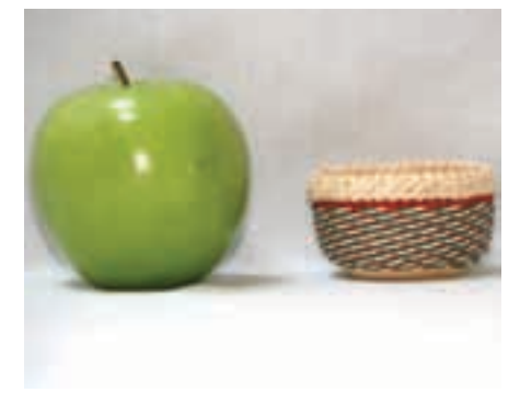
SA-4-130 Saturday 1:00pm-5:00pm

4 Hours 6”Wx12”Lx15”H (w/handle) All Levels $75