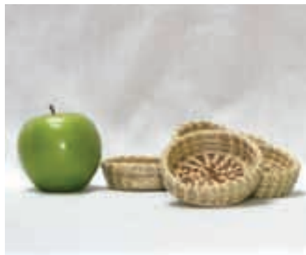
SA-4-262 Saturday 1:00pm-5:00pm