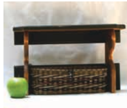
TH-6-238 Thursday 1:00pm-8:00pm

6 Hours 3½”Hx5” dia Beginner / Intermediate $50