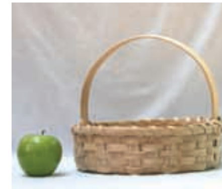
SA-4-31 Saturday 8:00am-12:00pm

4 Hours Basket #1 - 3”H x 4½” dia Basket #2 – 2”H x 3½” dia Beginner / Intermediate $55