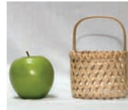
SU-4-62 Sunday 8:00am-12:00pm