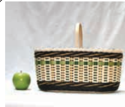
FR-8-222 Friday 8:00am-5:00pm

Kim's Garden Market Basket Char Ciammaichella Aurora, OH