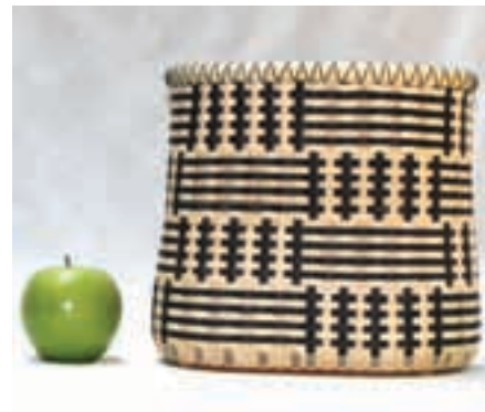
FR-8-306 Friday 8:00am-5:00pm

8 Hours 10"Wx 13½"Lx9"H Beginner/Intermediate $58