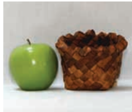
TH-6-202 Thursday 1:00pm-8:00pm