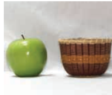
FR-4-254 Friday 1:00pm-5:00pm

4 Hours 2 3/4" W x 5 1/2" L x 3 1/2" H All Levels $65