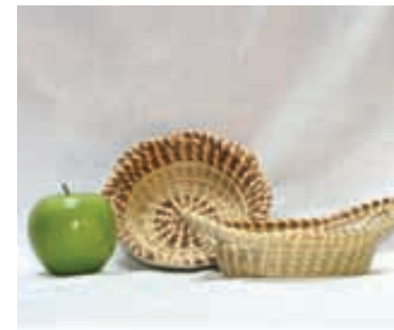
FR-8-263 Friday 8:00am-5:00pm

8 Hours 5 1/2" H x 8" dia Intermediate $120