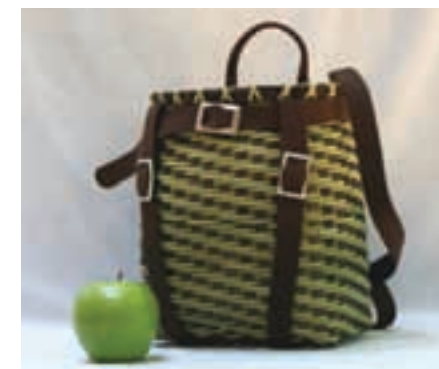
SA-4-45 Saturday 1:00pm-5:00pm