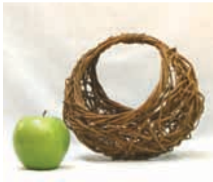
SA-4-164 Saturday 8:00am-12:00pm