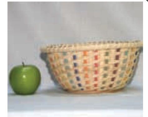
SA-6-20 Saturday 9:00am-4:00pm

4 Hours 3"Wx3"Lx3"H Beginner / Intermediate $40