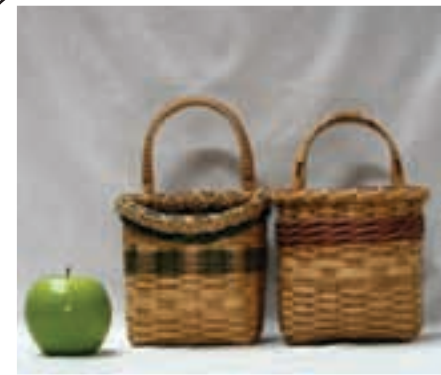
TH-MB-137 Thursday 4:00pm-6:00pm

Forget Me Not Doorknob Wall & Key Baskets Pati English Seneca, SC