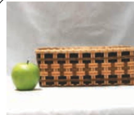
SU-4-275 Sunday 8:00am-12:00pm