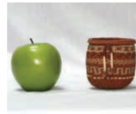
FR-6-228 Friday 9:00am-4:00pm

6 Hours 7½" Hx6" dia Intermediate / Advanced $40