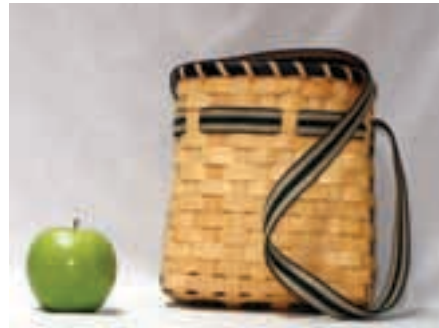
TH-MB-7 Thursday 1:00pm-3:00pm