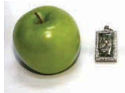
TH-MB-36 Thursday 1:00pm-3:00pm