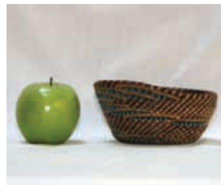
FR-8-204 Friday 8:00am-5:00pm