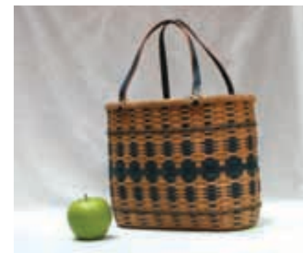
SA-6-84 Saturday 9:00am-4:00pm

6 Hours 7"Wx12"Lx7 1/2"H Intermediate $45