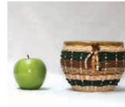
SU-4-286 Sunday 8:00am-12:00pm

4 Hours 7"Wx12½"Lx4½"H Intermediate/Advanced $40