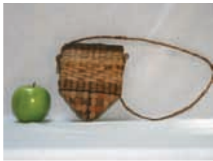
TH-4-338 Thursday 4:00pm-9:00pm