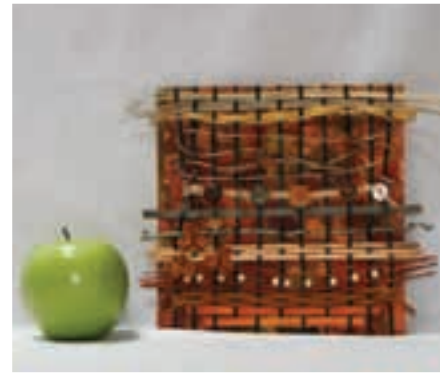
TH-MB-285 Thursday 1:00pm-3:00pm

2 Hours 4"Wx7½"Lx6"H All Levels (w/handle) $20