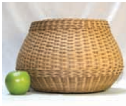
SA-8-215 Saturday 8:00am-5:00pm