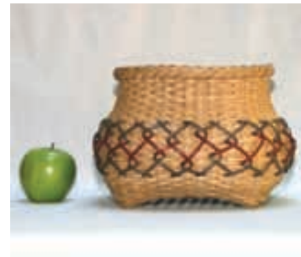
FR-8-157 Friday 8:00am-5:00pm