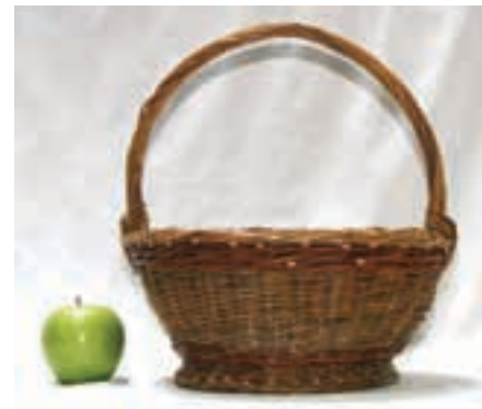
FR-8-310 Friday 8:00am-5:00pm

8 Hours 7"Wx11⅛"Lx10"H Beginner/Intermediate $64