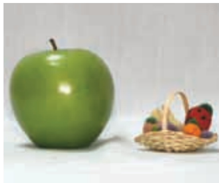
FR-4-284 Friday 1:00pm-5:00pm

4 Hours 4" H x 4 1/2" dia All Levels $45