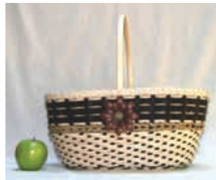
SA-8-227 Saturday 8:00am-5:00pm

8 Hours 12” Hx16” dia Beginner/Advanced $50