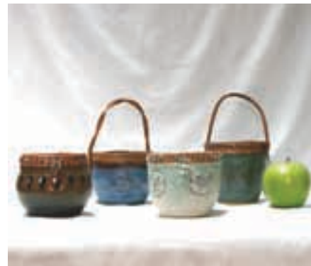
SA-4-181 Saturday 8:00am-12:00pm