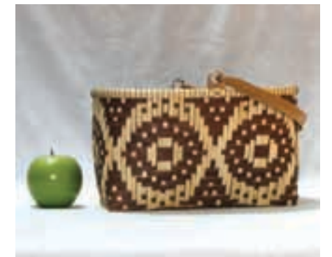
SA-8-134 Saturday 8:00am-5:00pm