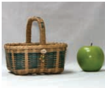
TH-MB-220 Thursday 4:00pm-6:00pm