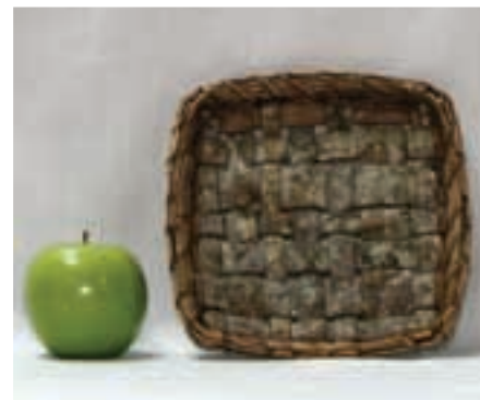
TH-MB-336 Thursday 1:00pm-3:00pm