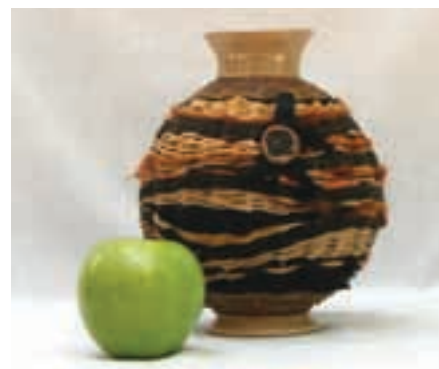
TH-6-290 Thursday 1:00pm-8:00pm