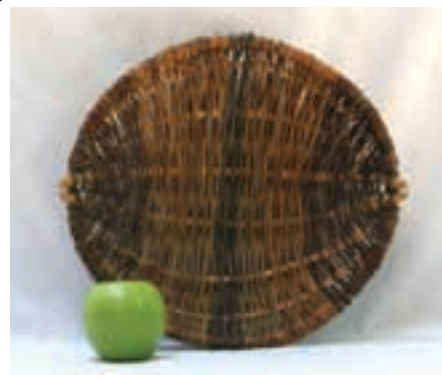
SU-4-162 Sunday 8:00am-12pm