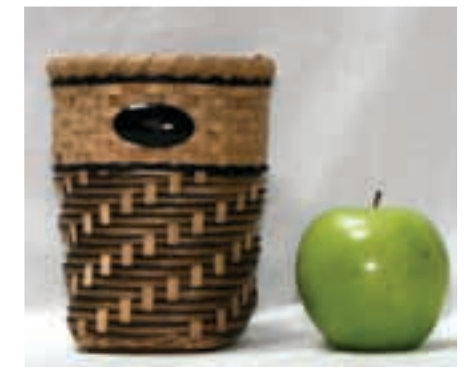
TH-MB-219 Thursday 1:00pm-3:00pm

2 Hours 1¼” x 3¾” (varies) All Levels $15