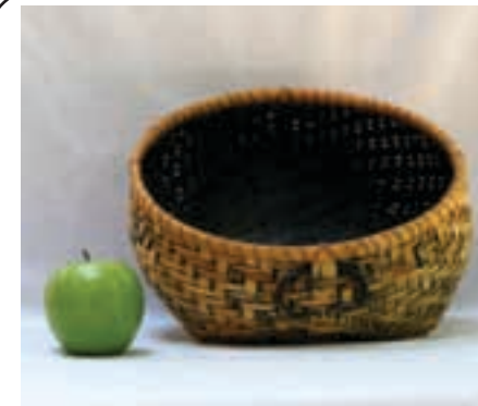
TH-4-6 Thursday 4:00pm-9:00pm

6 Hours 9" W x 8½" H x 7" dia at top Intermediate $45