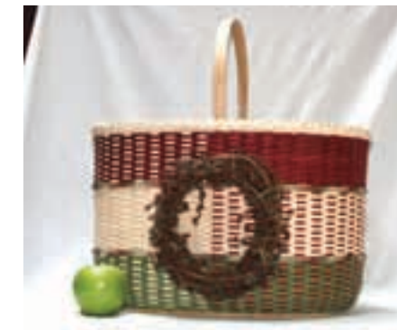
FR-8-303 Friday 8:00am-5:00pm

8 hours 8" W x 12" L x 9 1/2" H Intermediate / Advanced $75