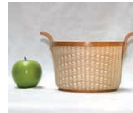
FR-8-253 Friday 8:00am-5:00pm

8 Hours 3" W x 12" L x 12 1/2" H Intermediate $49