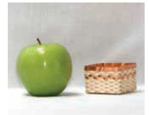
SU-4-102 Sunday 8:00am-12:00pm

4 Hours 9"Wx 12" Lx 5 1/2"H All Levels $38