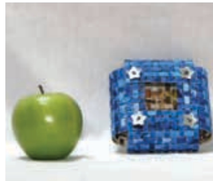
SA-6-100 Saturday 9:00am-4:00pm