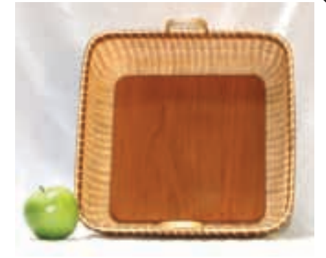
SA-8-105 Saturday 8:00am-5:00pm

8 Hours 3"Wx4"Lx2½"H Beginner / Intermediate $95