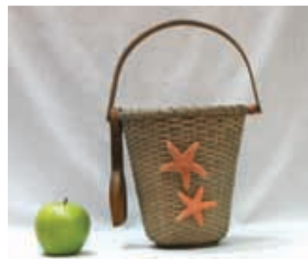
SA-6-312 Saturday 9:00am-4:00pm

6 Hours 8" W x 8" L x 11¼" H Beginner / Intermediate $56