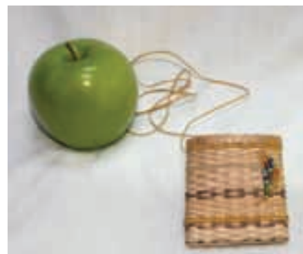
SU-4-247 Sunday 8:00am-12:00pm

4 Hours 4 3/8" Wx1 1/4" H All Levels $36