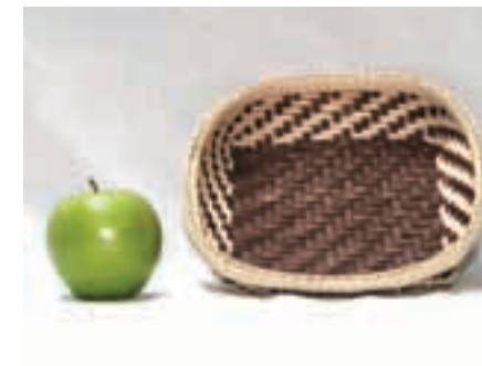
SU-4-319 Sunday 8:00am-12:00pm