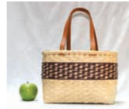
FR-8-77 Friday 8:00am-5:00pm