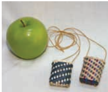
TH-4-248 Thursday 4:00pm-9:00pm