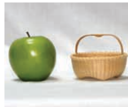
TH-6-61 Thursday 1:00pm-8:00pm