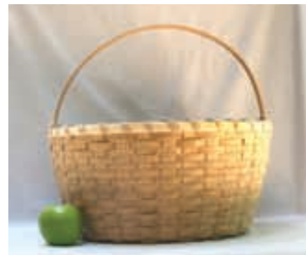
FR-8-32 Friday 8:00am-5:00pm