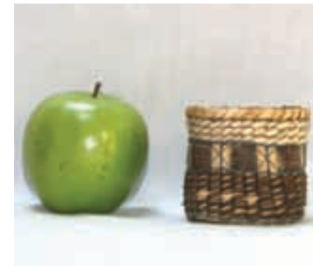
SA-4-339 Saturday 8:00am-12:00pm

4 Hours 5"Wx5"Lx5"H Beginner / Intermediate $50