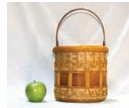
FR-8-120 Friday 8:00am-5:00pm

8 Hours 9"H w/handle x6½" dia Intermediate $90