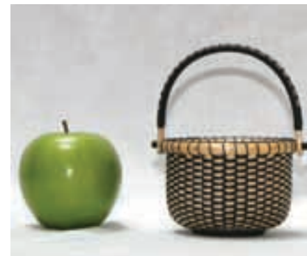
SA-8-111 Saturday 8:00am-5:00pm