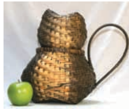
FR-8-3 Friday 8:00am-5:00pm