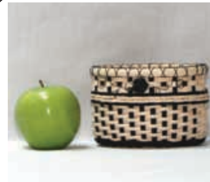
SU-4-53 Sunday 8:00am-12:00pm

Packaging Express will be available Sunday morning from 8:30 am – 1:00 pm in the hotel lobby to handle your shipping needs.