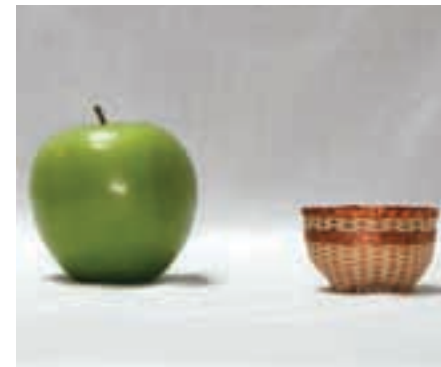
FR-4-104 Friday 1:00pm-5:00pm

6 Hours 1½"Wx10½"Lx10¼"H Beginner/Intermediate $45