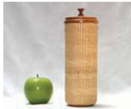
FR-8-28 Friday 8:00am-5:00pm