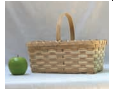
SA-4-34 Saturday 1:00pm-5:00pm