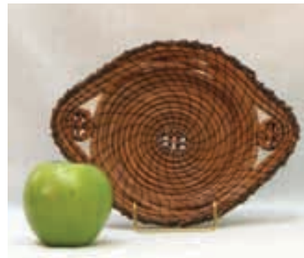
FR-6-311 Friday 9:00am-4:00pm

6 Hours 8"Hx6" dia Intermediate/Advanced $40