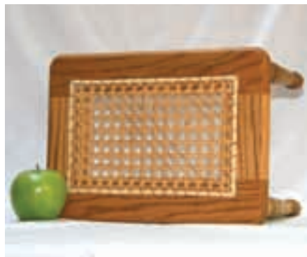
FR-8-25 Friday 8:00am-5:00pm