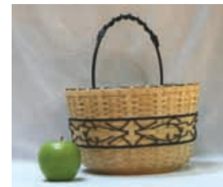
SA-4-81 Saturday 8:00am-12:00pm