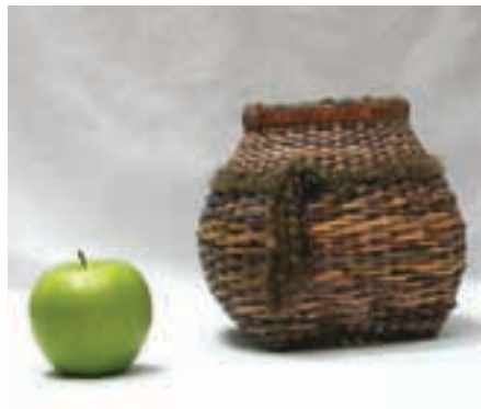
FR-6-270 Friday 9:00am-4:00pm