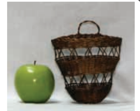
TH-MB-155 Thursday 1:00pm-3:00pm

2 Hours 8” Wx12”Lx12” (14” handle) All Levels $36