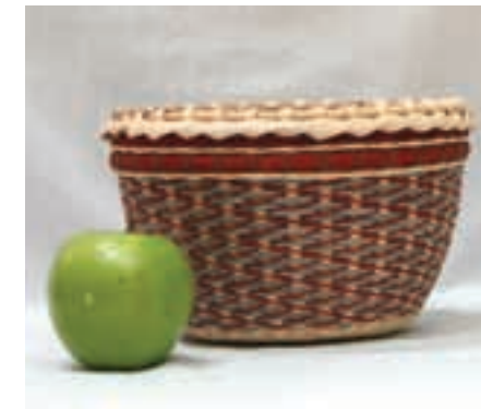
FR-6-52 Friday 9:00am-4:00pm

6 Hours 17"Lx8"Hx12½ dia Intermediate $57