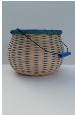
FR0205-----2pm-9 pm The Beach Shell Pot