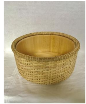
FR0203-----2pm – 9 pm Fri Nantucket Salad Bowl