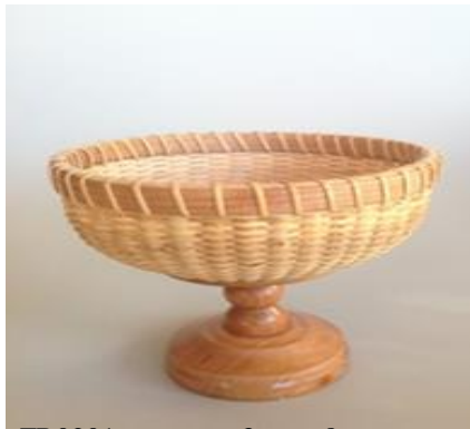
FR0201-----3pm – 8pm Nantucket Small Pedestal Basket